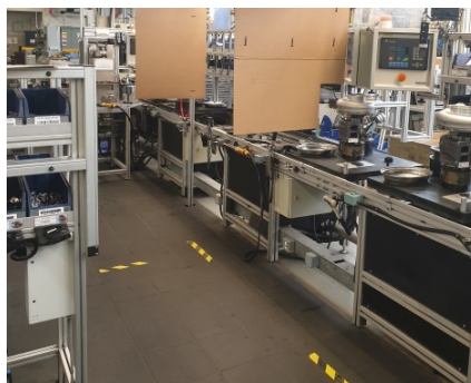
Temporary board dividers