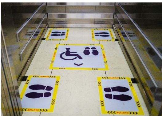
Example lift practices