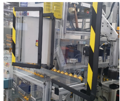
Perspex dividers with edge marking