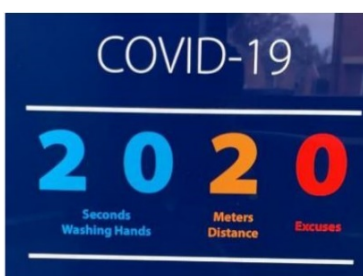
Signage to promote hygiene and social distancing measures