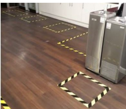
Distancing markers in a kitchen