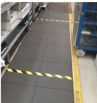
2m floor markings