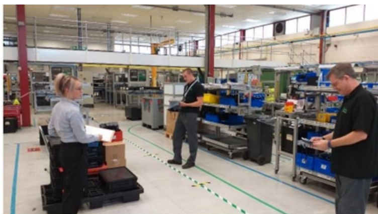
Shift briefing with social distancing